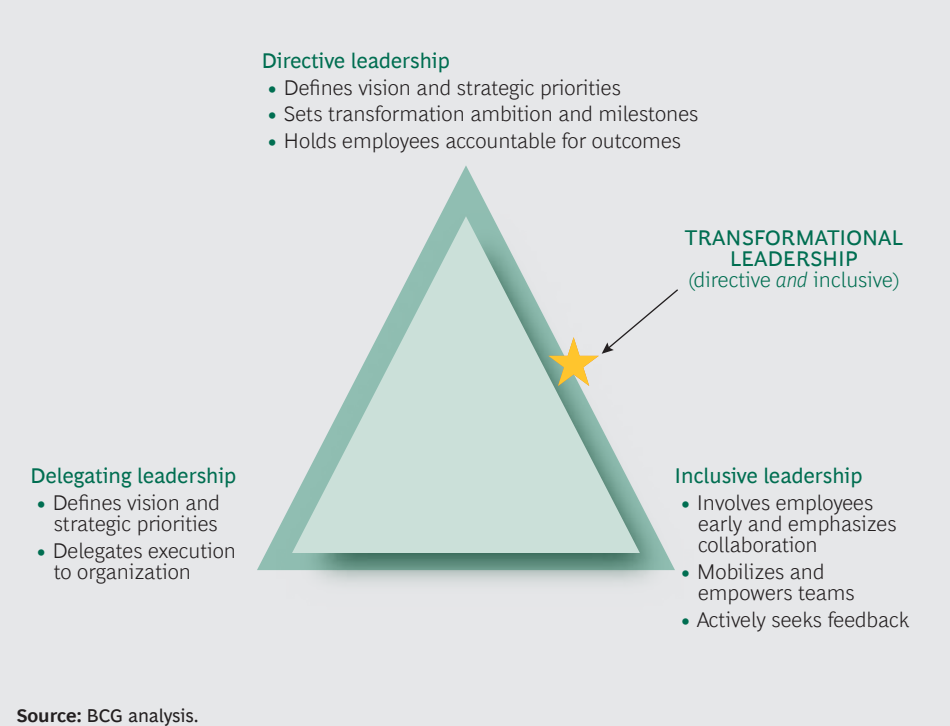
EXHIBIT 4 | Transformational Leadership Must Be Directive and Inclusive

Inclusive leaders involve employees early in the process—well before implementation—and make clear how their contributions help fulfill the larger purpose and objectives of the transformation. By taking these steps, the company's leadership is able to secure a more authentic commitment from employees. Inclusive leaders also mobilize and empower teams by giving them some freedom, within a prescribed framework, to define and implement specific initiatives in the transformation. And they solicit honest feedback and take it into account in modifying the transformation in light of issues that have come up during implementation.