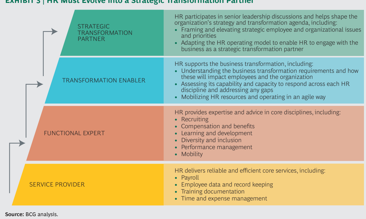
EXHIBIT 3 | HR Must Evolve into a Strategic Transformation Partner

in a more volatile environment, strategic workforce planning becomes more important—and more difficult. HR must take the lead in assessing and anticipating emerging skills gaps and in developing strategies to meet future needs for talent. (See "Transforming Technology Companies: Putting People First," BCG article, November 2014.)