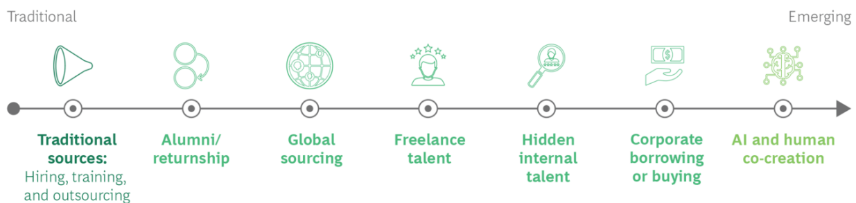
Exhibit 2 - Companies Experiment with New Talent Sources